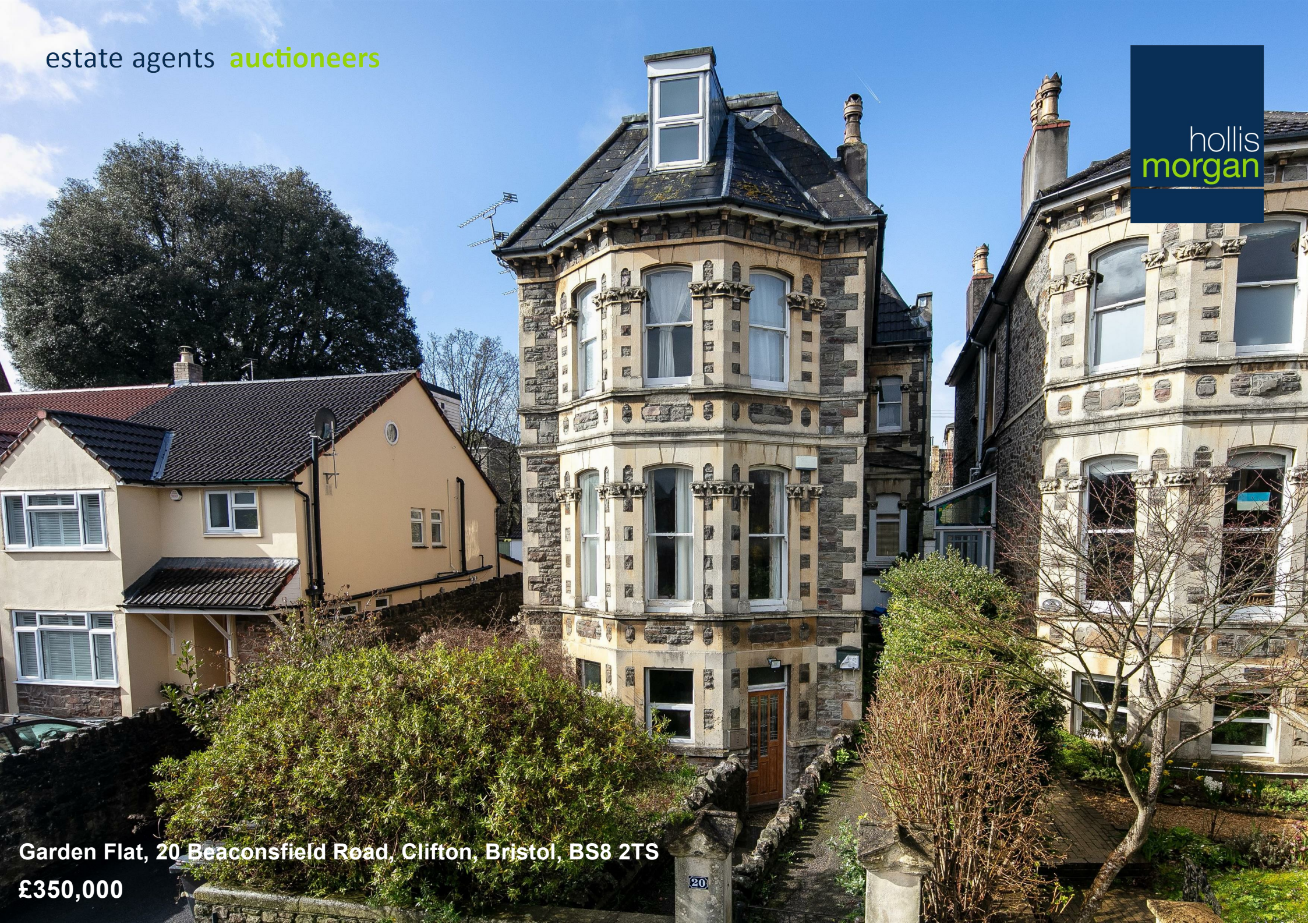
Garden Flat, 20 Beaconsfield Road, Clifton, Bristol, BS8 2TS